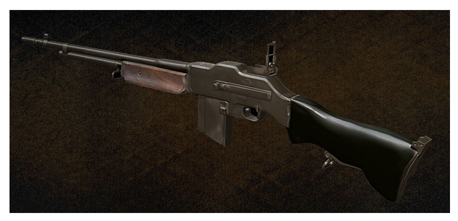
Sculptris Artist: Anthony Myers

Enables real-time anti-aliasing as you sculpt, performed by your graphics card's OpenGL feature.