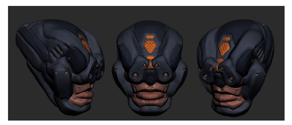
Sculptris Artist: Marc Nagel

It is important to remember that once you have entered Paint Mode you may not return to Sculpt Mode. This is because UV mapping depends upon the point structure of the model, and the way Sculptris divides parts of a model as you sculpt causes the points to change dramatically. That would immediately break any UV mapping that has been assigned, which in turn makes any texture painting useless. Make sure that you're totally happy with your sculpting before you send your model to Paint Mode!