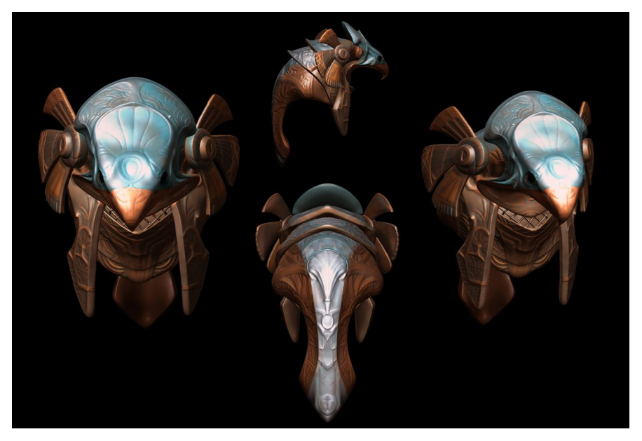
Sculptris Artist: Anthony Myers

The Export/Import PSD feature should be very familiar for people who have previously used ZAppLink in ZBrush. It's similar in many ways.