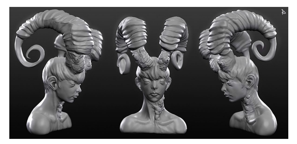
Sculptris Artist: Bobby Bath

If importing your model from another application, be sure not to use overlapping UV's. Each point on the UV mapping must correspond to a single point on the model. (For example, you should not lay your UV's out so that both hands share the same UV coordinates.) Attempting to use overlapping UV's is not currently supported and will most likely result in unexpected behavior when painting the model.