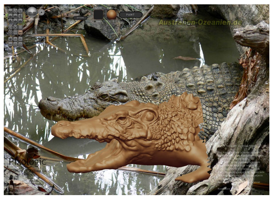
Sculptris Artist: Yongkiat Karnchanapayap

To return to the default image, click this button and select the background.png file which is located in your Sculptris Data folder.